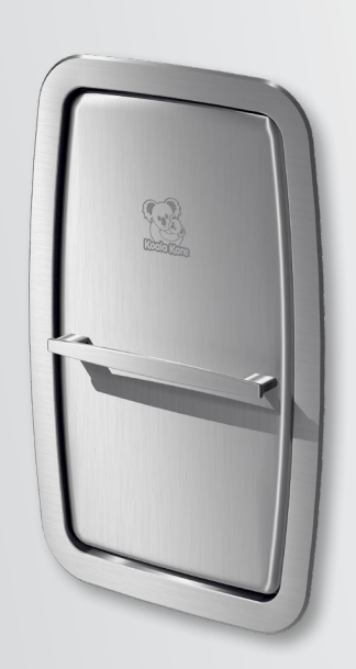
KB311-SSRE Vertical Recessed-Mounted