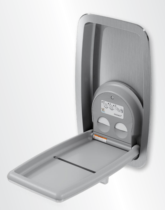
KB311-SSRE Vertical Baby Changing Station