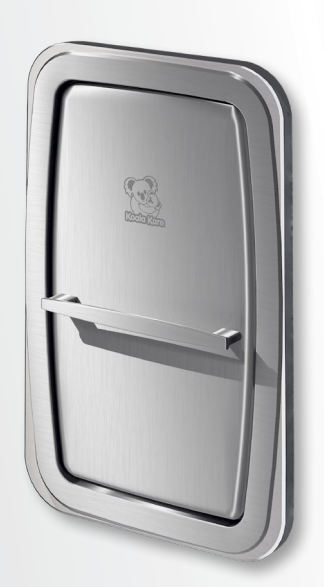
KB311-SSWM Vertical Surface-Mounted