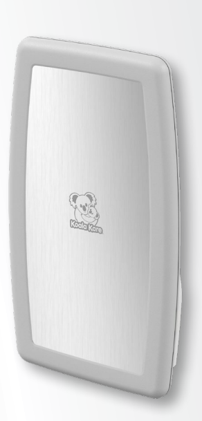
KB301-05SS Vertical Surface-Mounted