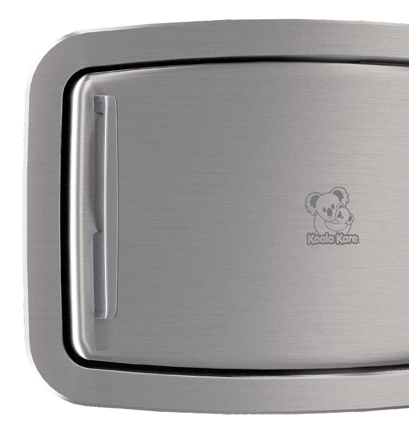
KB310-SSRE Horizontal Baby Changing Station

All KB300 platform products are designed to withstand frequent use thanks to an enhanced integral steel frame and have been tested to have minimal deflection with 200 lbs of center-loaded static weight. Koala Kare partners with Microban® to integrate powerful product protection into our baby changing stations that helps inhibit the growth of stainand odor-causing bacteria on product surfaces. Along with amenities like an improved liner dispenser and an external stainless steel bag hook, KB300 units support an increased focus on hygiene to satisfy end-users.