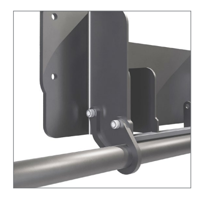
integral frame designed to withstand frequent use.