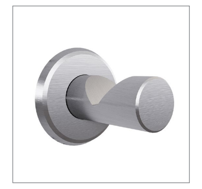
Includes external stainless steel bag hook to safely stow diaper bags off the floor and in close proximity for the caregiver's use.