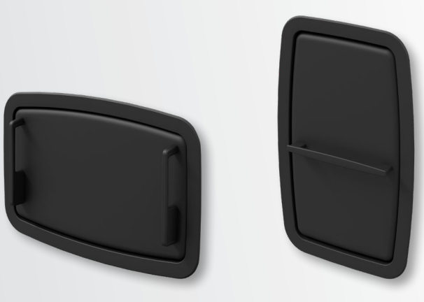
KB310-MBLK Horizontal - KB311-MBLK Vertical Recessed-Mounted