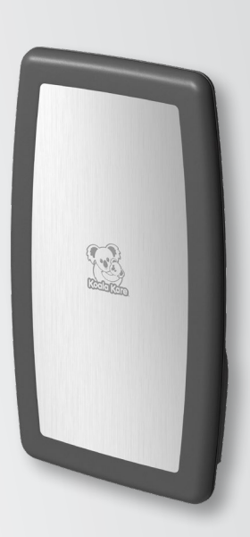
KB301-01SS Vertical Surface-Mounted